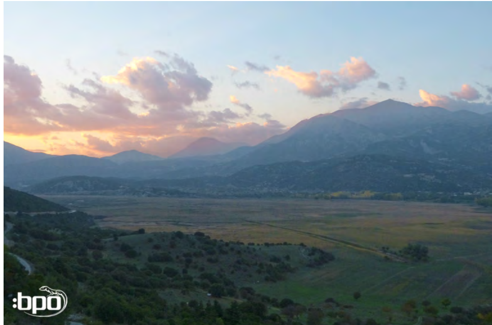
Finally, our arrival at Stymphalos