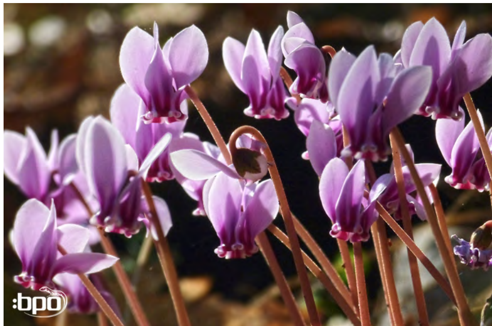
Flowers instead of herps: Cyclamen graecum and...