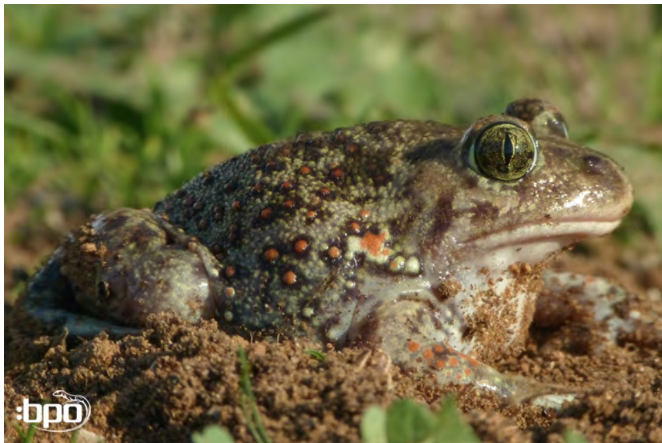
Pelobates syriacus – this species looks like a skin disease...