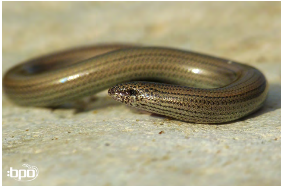
...with Ophiomorus punctatissimus