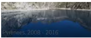
Pyrenees, 2008 - 2016