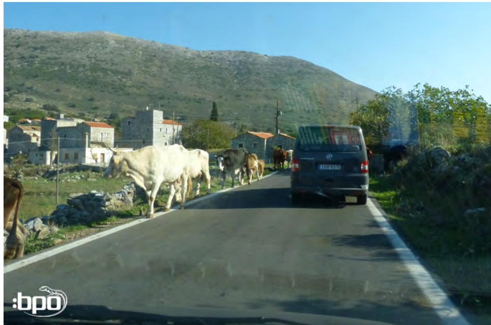
Road block on Mani