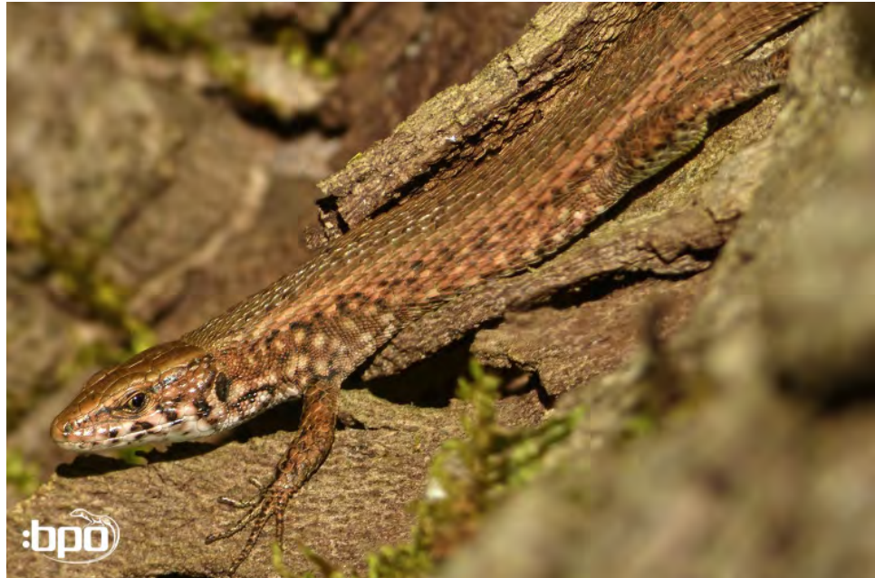
Algyroides nigropunctatus – usually preferring shade – was basking on tree trunks in the evening sun.