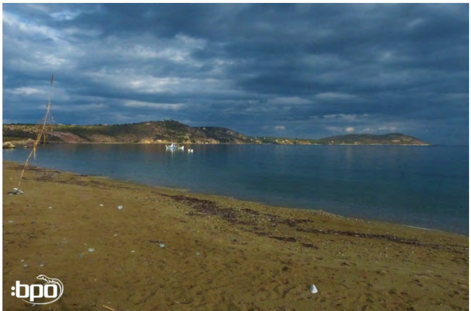
Beach at Gythio...