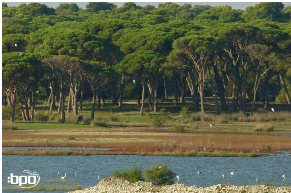
Wetlands at Kalogria: here, our colleagues introduced us to the art of bird-watching...