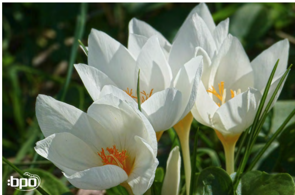
... Crocus boryi