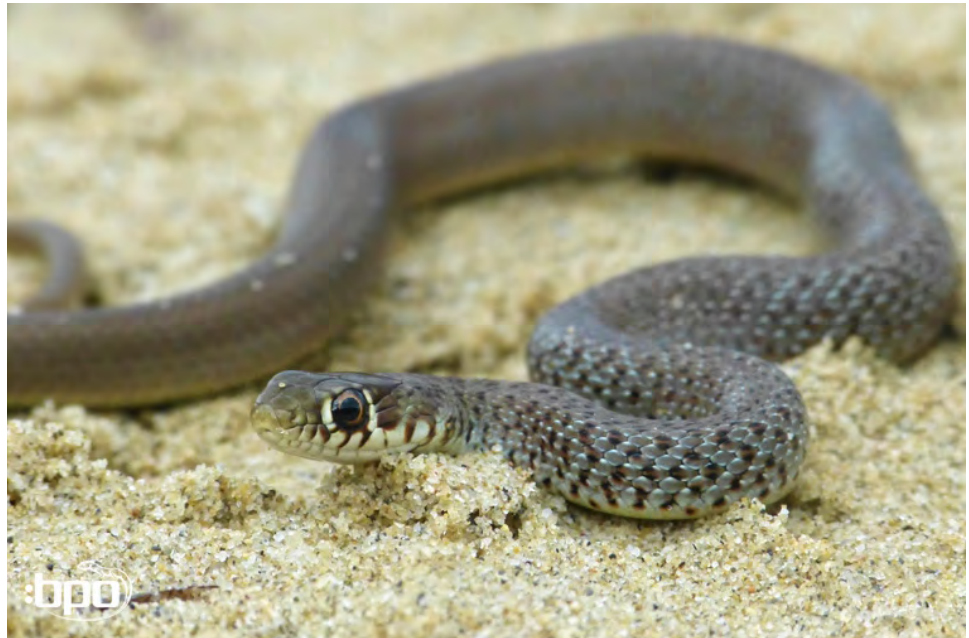
Snake on the beach: Hierophis gemonensis