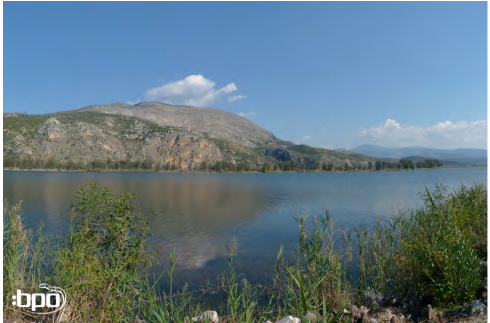
Kaiafa Lake ...