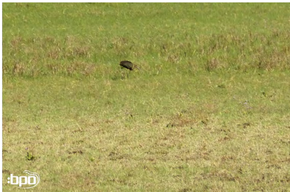
...this professional shot shows an ibis ( Plegadis falcinellus ) – we were impressed...