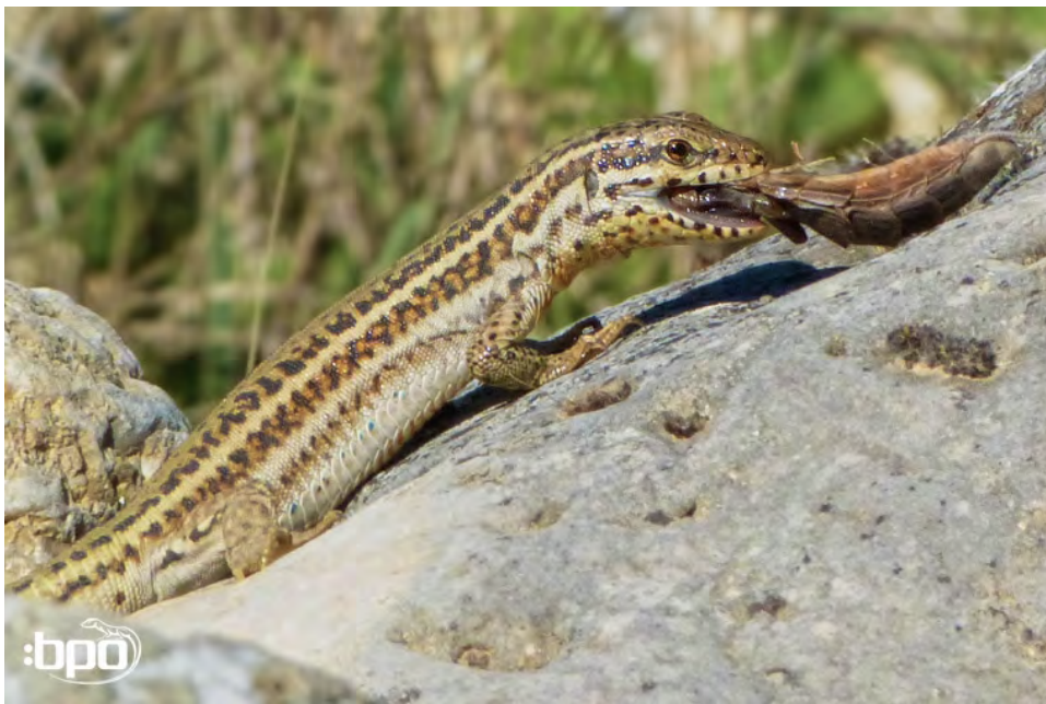
Female Podarcis erhardii with king-size prey...

Whereas our flight from Düsseldorf was in time the others were delayed. We decided not to wait for them but to proceed directly towards western Peloponnese. During our way we had a stopover to photograph some lizards in the Feneos area. After sunset we finally reached Kalogria where our colleagues also arrived at late night (they had done a side trip to the mountains, too).