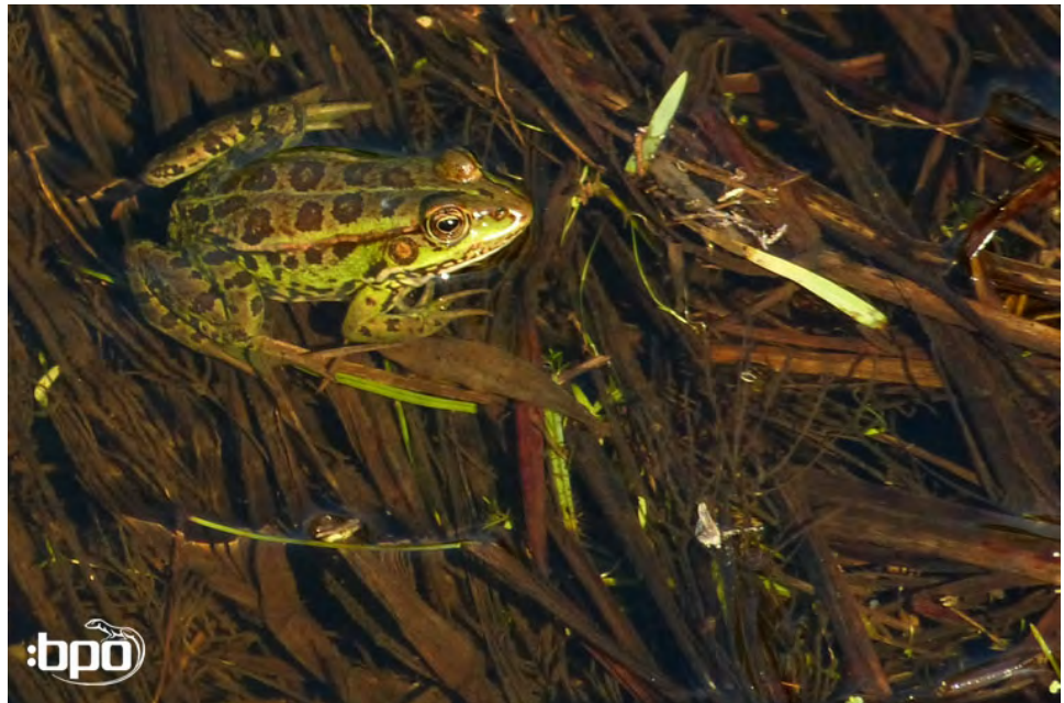
Poor substitute for "real" herps: Pelophylax epeirioticus