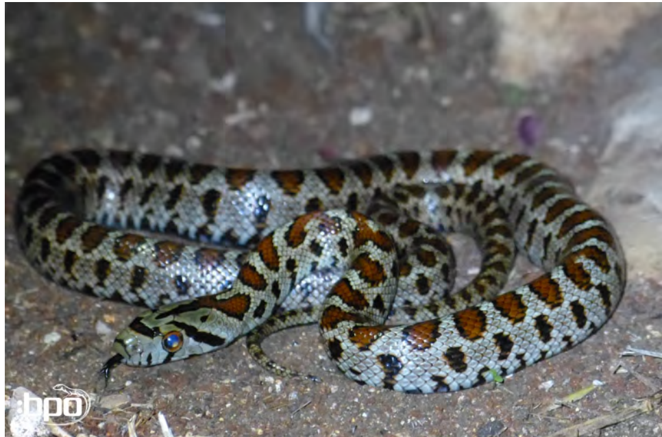
This juvenile Zamenis situla was active in the darkness as well.