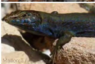
Mallorca / ...