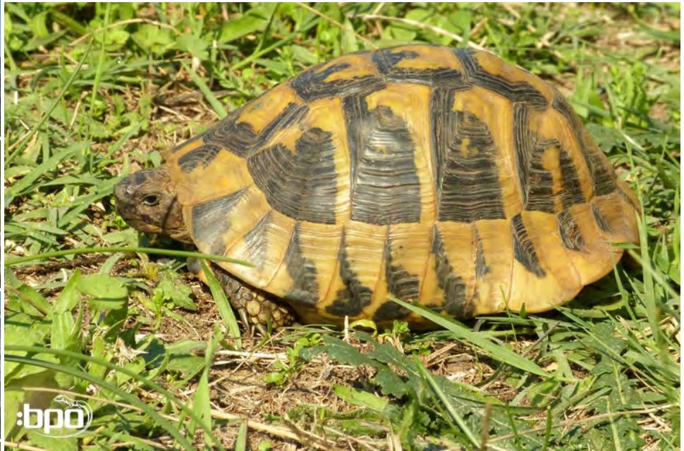
Uncooperative model: Testudo hermanni