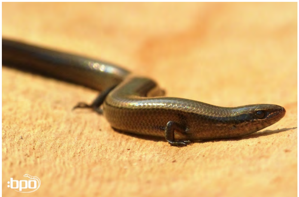
...and Ablepharus kitaibelii