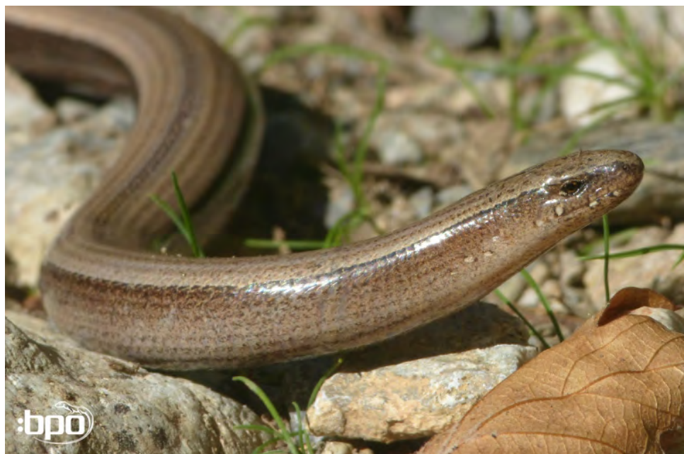
The second slow worm species: Anguis graeca