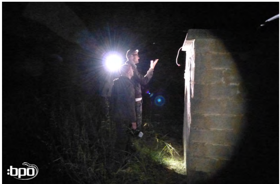
Night-time burglars – searching for: