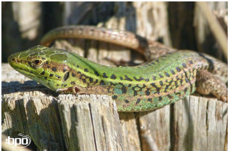
...and another one: this species is quite variable