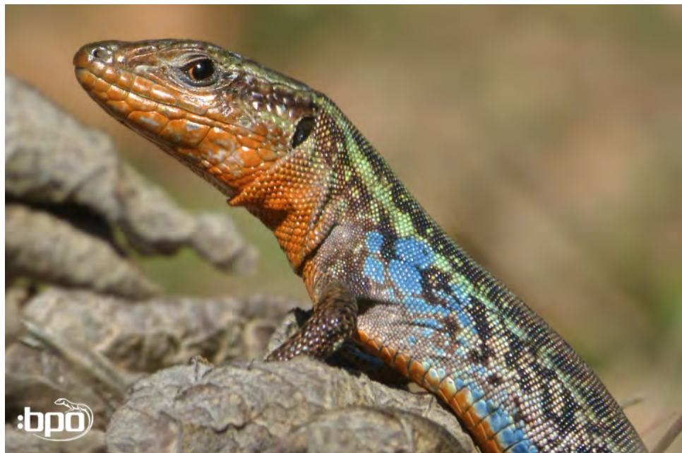
A gorgeous species, even in late autumn: Podarcis peloponnesiacus