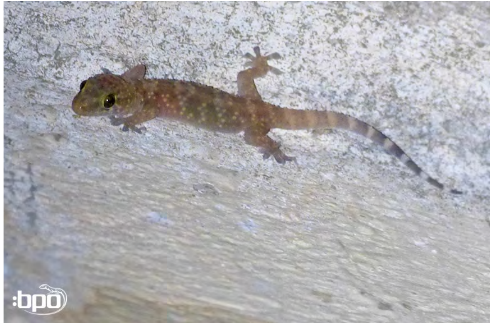
...and some Hemidactylus turcicus .