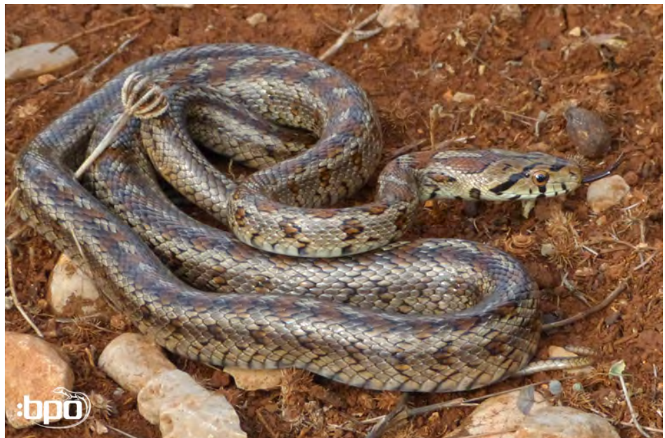
Nice surprise at the end of a beautiful journey: adult Zamenis situla