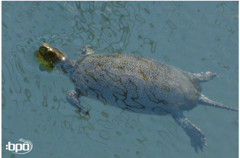
...home of Emys orbicularis ...