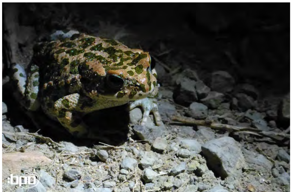
We came across this Bufo viridis ...