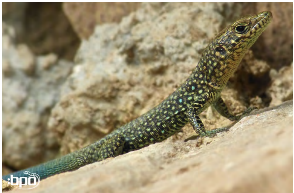
Juvenile Hellenolacerta graeca with blue tail