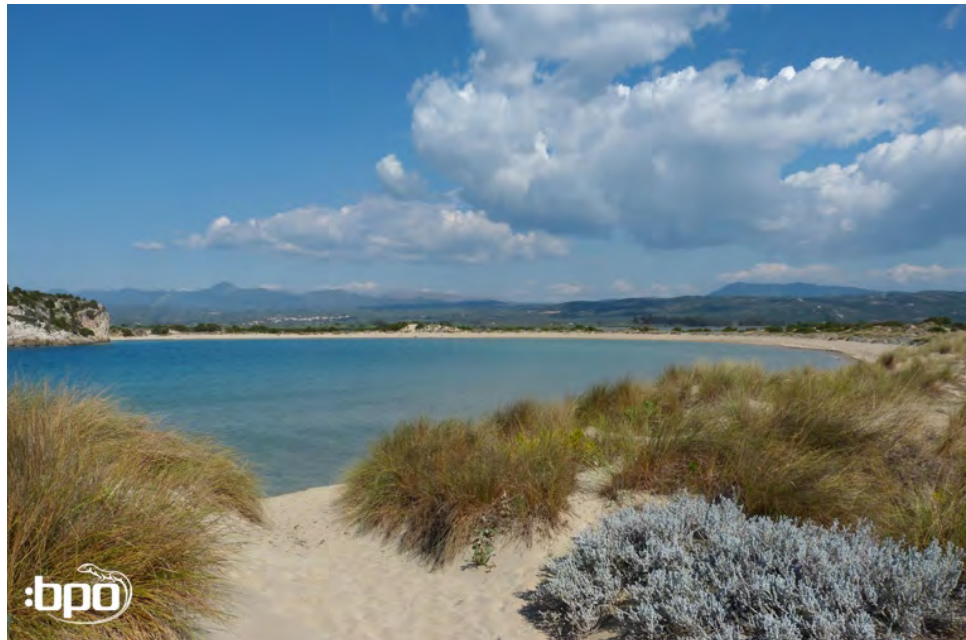
The blue lagoon – a real holiday picture, finally...