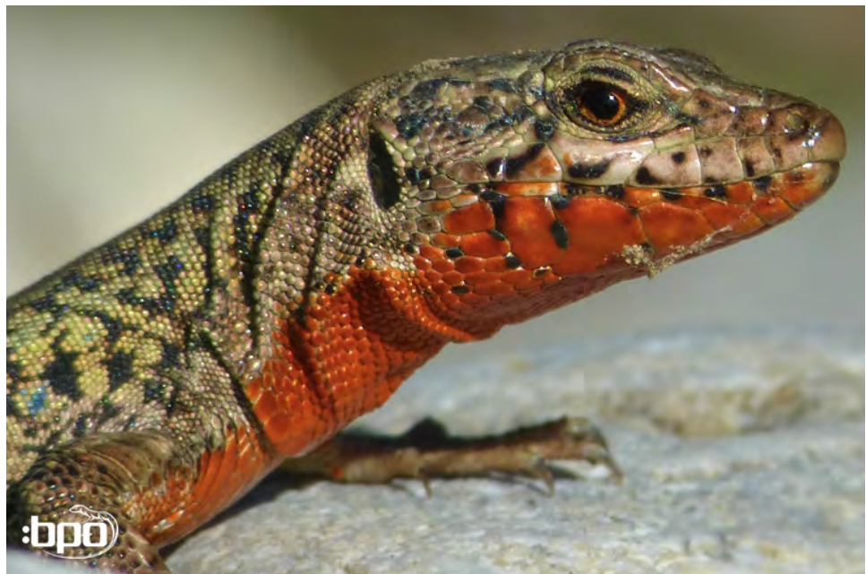
...we love subspecies livadiacus!