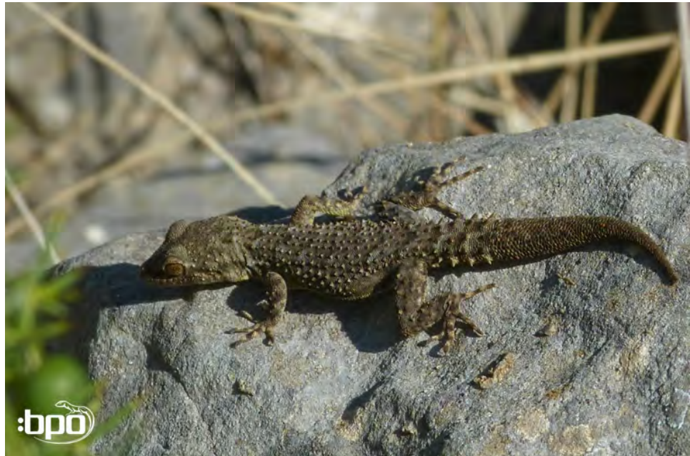
Our only shot of Madiodactylus kotschyi

Criss-cross through Mani Peninsula – without remarkable findings. In the evening we arrived at our next stay in Kardamili where we met our team again.