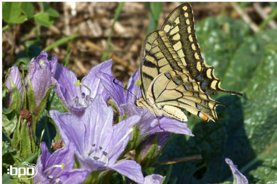
Mandragora autumnalis with Papilio machaon