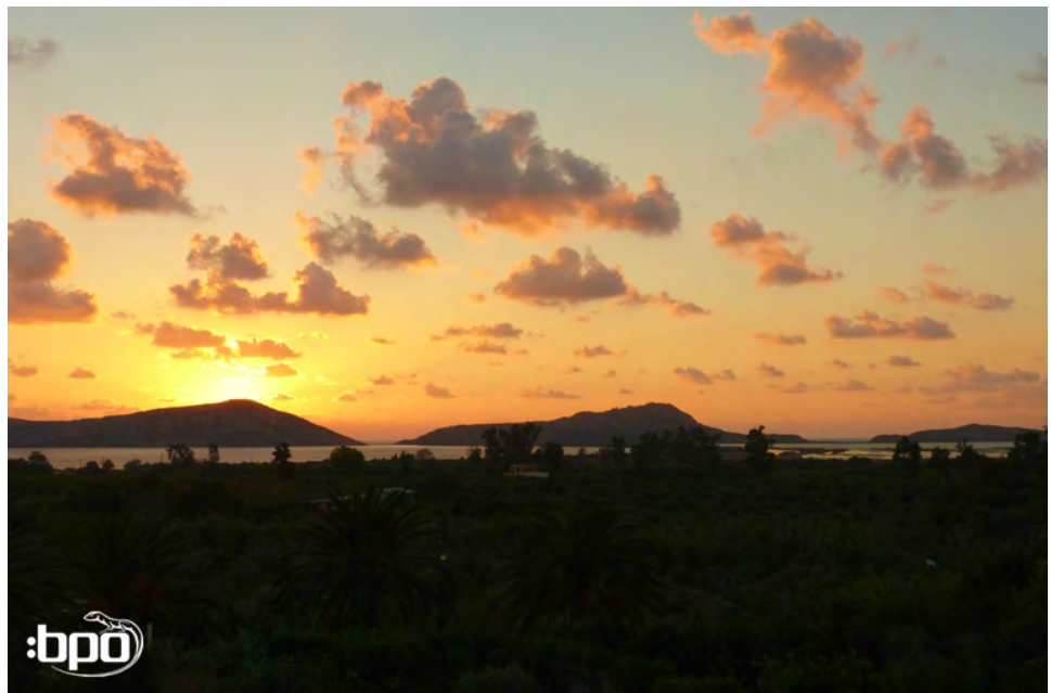
Sunset at the West Coast: starting signal for a night trip