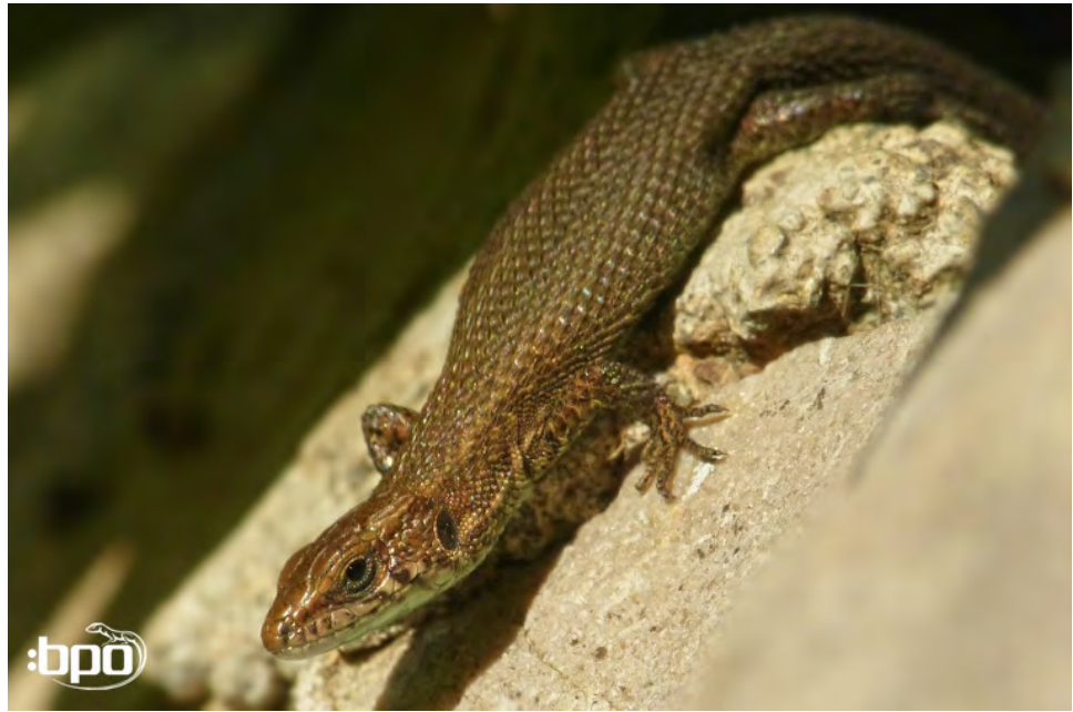
Algyroides moreoticus warming up in the morning sun

After some ineffective snake hunting we left the Peloponnese west-coast towards Mani Peninsula. There, we left our colleagues for a side trip to Gythio. Although we had some rain in that area we were able to find herptiles in a nice coastal habitat.