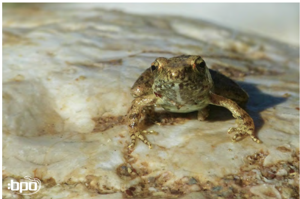
A juvenile Rana graeca