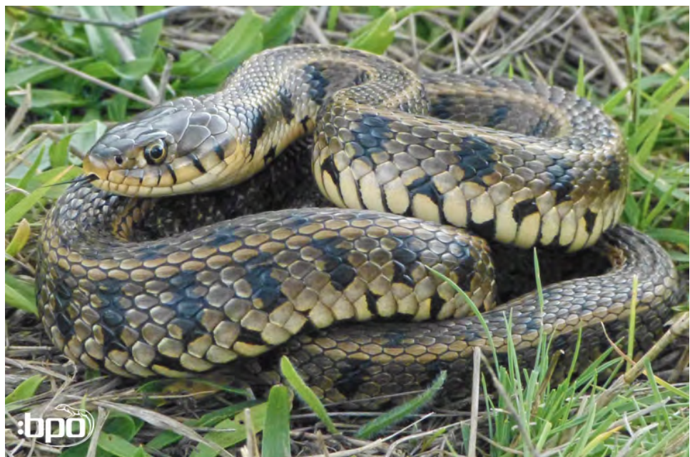
Natrix natrix persa