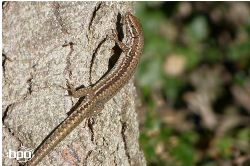
Podarcis muralis climbing on a tree