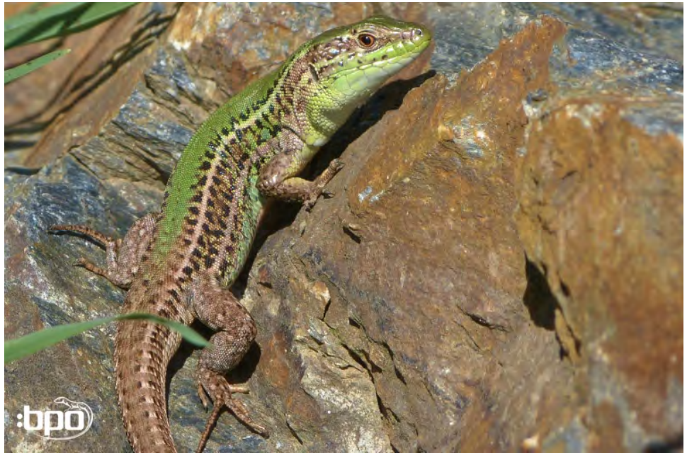
Beautiful Podarcis tauricus ...