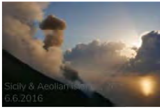
Sicily & Aeolian Islands 6.6.2016