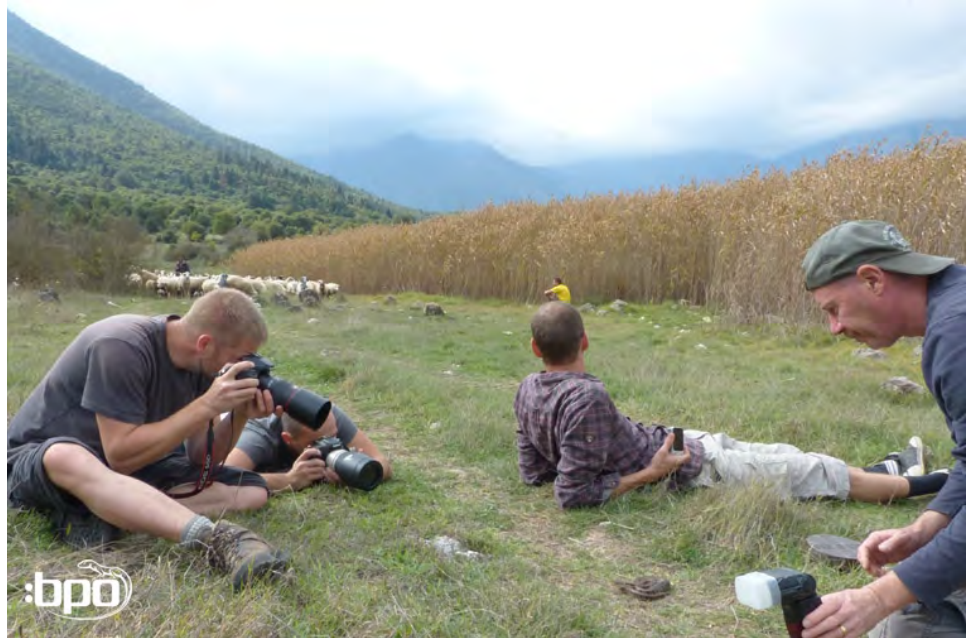
Photographers, spoiling the shepherd's day