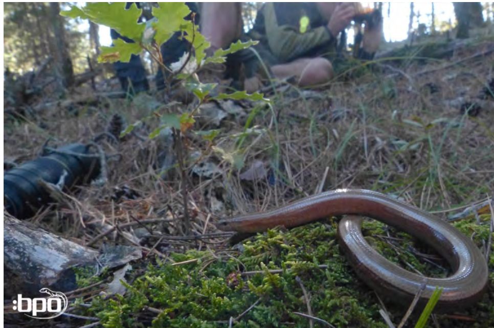
Anguis cephalonica and photographers

Despite of dense morning fog in the Feneos-Basin, we started hunting for lizards. After the fog lifted we found plenty of herps – for us, the most productive day of the trip!