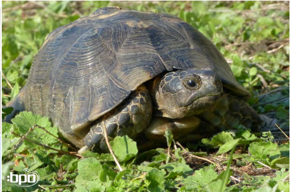
Cooperative model: Testudo marginata